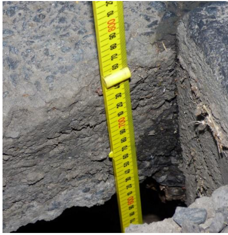
Depth of void around 0.6-0.75m