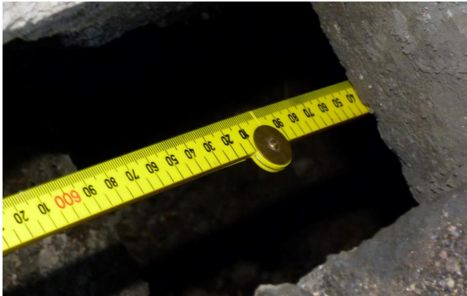
Void significantly undercutting the road to west