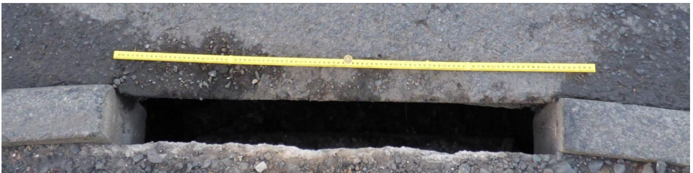
The Folding Ruler is 1m long