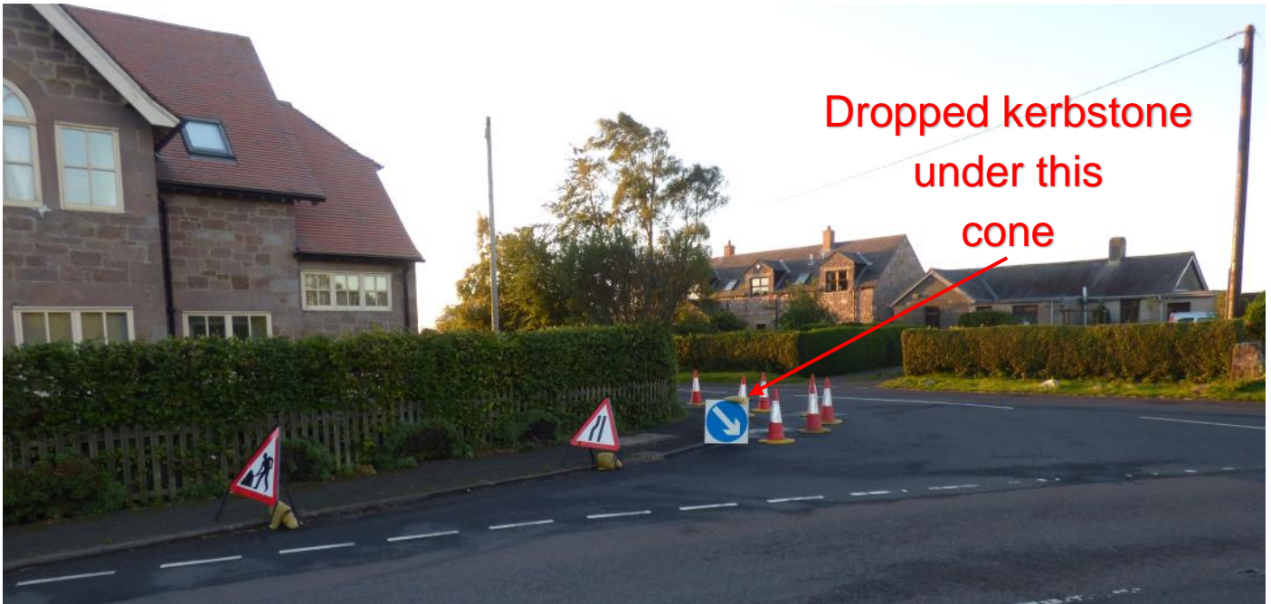
North West view on junction B6525 & B6353 – signs and cones in place by 2100hrs 8 th September