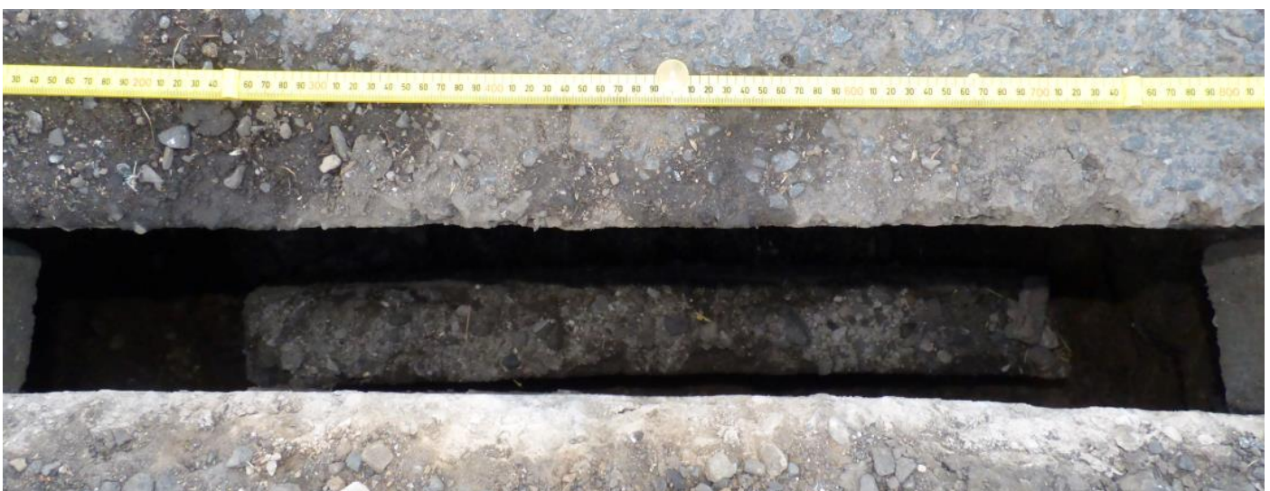
Kerbstone has dropped into the void